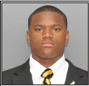
Defensive Student-Athlete of the Week (Sept. 28)